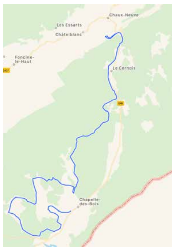
Trans 25 CT and Trans 25 FT

Transju' 68 FT Transju' Marathon Transju' Classic